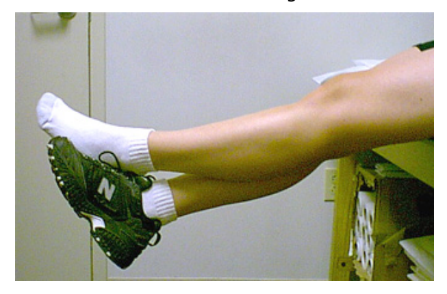
Figure 7. Use the non-injured leg to straighten the knee

2) Active-assisted extension is performed by using the opposite leg and your quadriceps muscles to straighten the knee from the 90 degree position to 0 degrees. Hyperextension should be avoided during this exercise. See Figure 7: