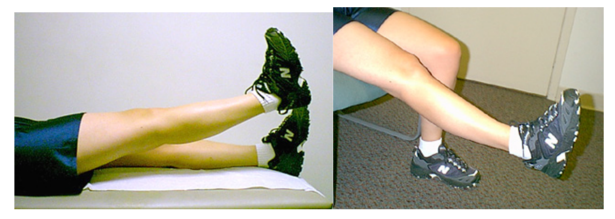
Figure 9. Straight leg raises – lying (left) and seated (right)

This exercise can be performed out of the brace when the leg can be held straight without sagging (quad lag). Once you have gained strength, straight leg exercises can be performed while seated. See Figure 9