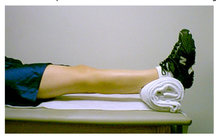
Figure 1. Heel prop using a rolled towel.