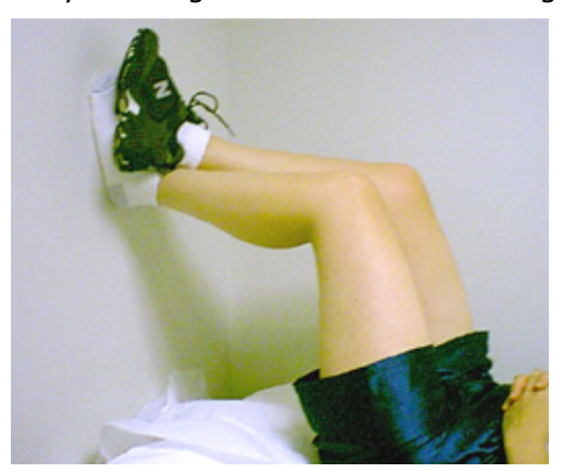
Figure 3. Wall Slide: Allow the knee to gently slide down