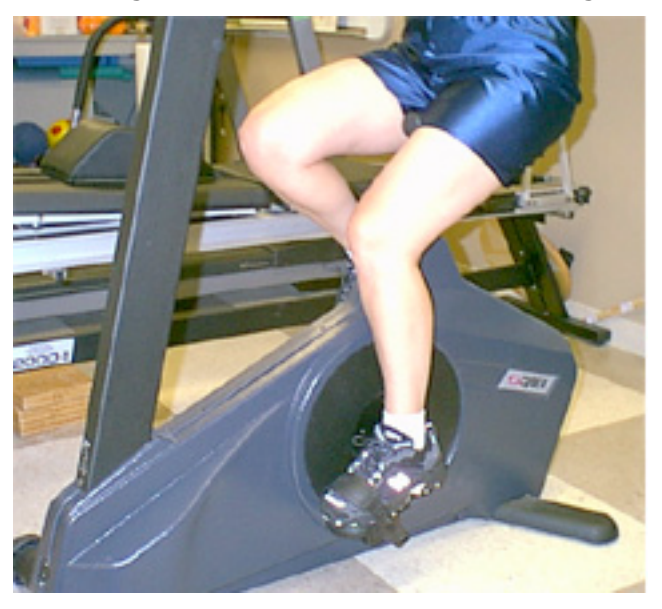
Figure 6. Stationary Bicycle helps to increase strength

1) Stationary Bicycle. Use a stationary bicycle two times a day for 10 - 20 minutes to help increase muscular strength, endurance, and maintain range of motion. See Figure 6