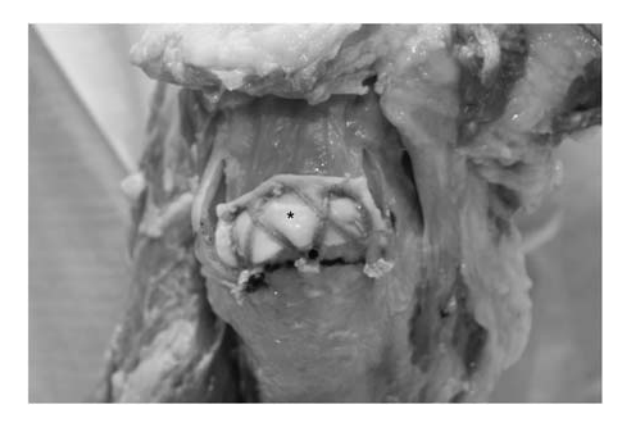
FIGURE 3. Cadaveric example of a double-row rotator cuff repair using graft augmentation (asterisk). The graft has been incorporated into a linked-bridging double-row rotator cuff repair.

Repair of retracted rotator cuff tears can result in high tensile loads on repair constructs. Poor tissue quality resulting from chronically torn or previously repaired tissue can also predispose repairs to failure. Under these circumstances graft