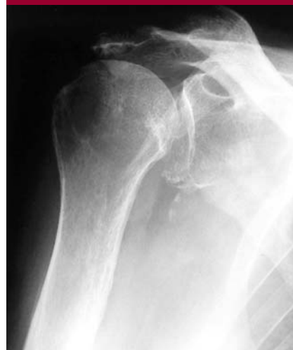
Neutral anteroposterior radiograph of a shoulder with a chronic massive rotator cuff tear. There is reduction of the acromiohumeral space, and the humeral head is elevated relative to the glenoid. (Reproduced from Green A: Chronic massive rotator cuff tears: Evaluation and management. J Am Acad Orthop Surg 2003;11:321-331.)

and limitations of selected treatment interventions to appropriately adjust the postoperative course of rehabilitation of each patient.